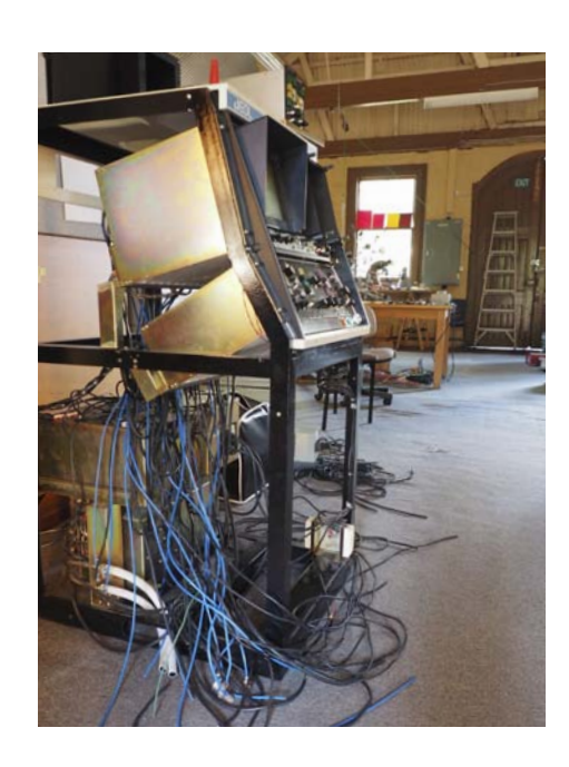
The JEOL JSM-35 in a state of disassemblage ???????? Photograph Catherine Truman

Yet ironically, original signatures inspired Autobiographies. Gibbins observed that the pages of the ETEC Autoscan Schematics were signed or initialled by each contributor, then proceeded to extract data on each engineer or designer, their schematics and comments. The resultant sensitive and intriguing text creates parallel dialogues amongst the characters – interweaving their humanity with their profession; inviting creative collaborations with the other artists.